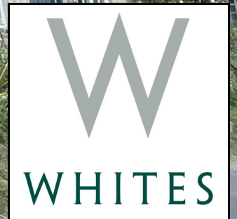
3 Thatch Cottages Fifield Bavant, Broad Chalke, Salisbury, Wiltshire, SP5 5HT